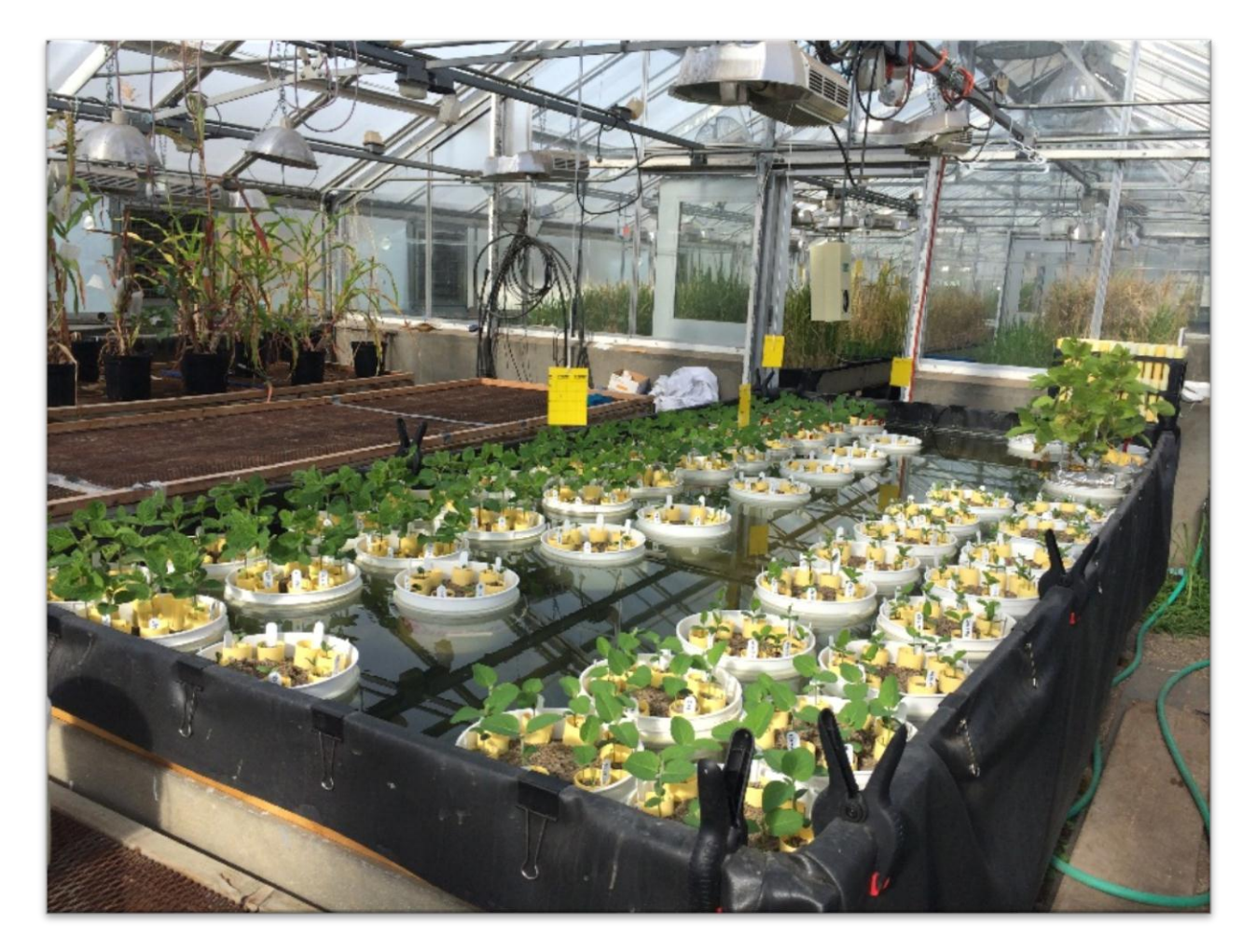
Fig. 1. Water bath with Soybean differential lines that were infested with different SCN populations extracted from soil samples. The soil samples were collected from soybean fields in South Dakota. The water bath was kept at 80 F to provide conducive environment for SCN to develop.

numbers, SCN was first increased on a susceptible cultivar and then infested to the SCN differential lines.