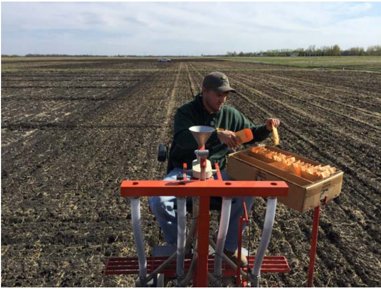
Trial was planted on May 4, 2015.