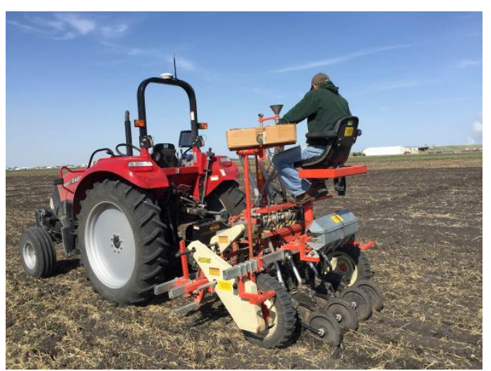
Plots were planted with a 4 row x 14 inch planter.

The highest yield (55.7 bu/a) of all treatments was reached with the later maturing variety receiving a seed treatment, and 50 lb. N at the R2 (full bloom growth stage) compared with the late maturing variety control (no seed treatment and no other treatment), which yielded 50.3 bu/a.