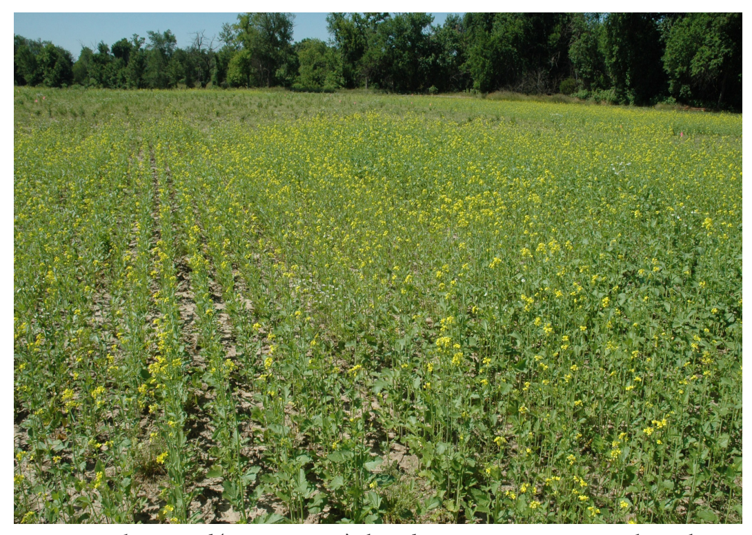
Figure 2. Might Mustard ( Brassica juncea ) planted as a cover crop prior to soybean planting.