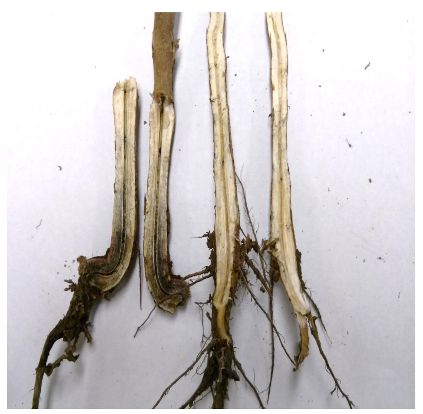
Figure 1. Charcoal rot, caused by the fungus Macrophomina phaseolina causes a grey, charcoal-colored growth in infected soybean roots. The plant on the left is highly infected. The plant on the right has minor infection. As the disease progresses, the roots atrophy and die, limiting seed development and reducing yield.