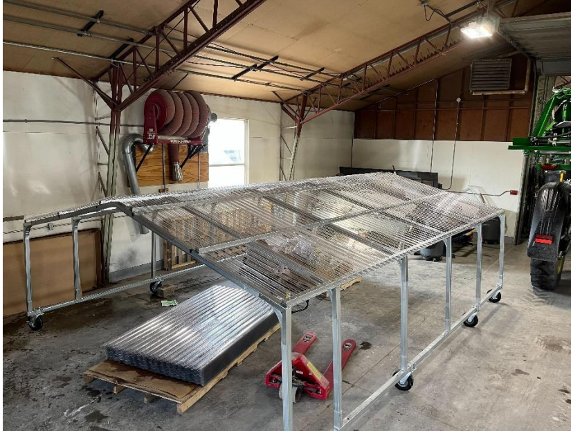
Rainout shelters under construction.