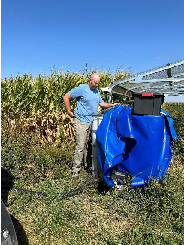
Filling the Water Totes weekly.