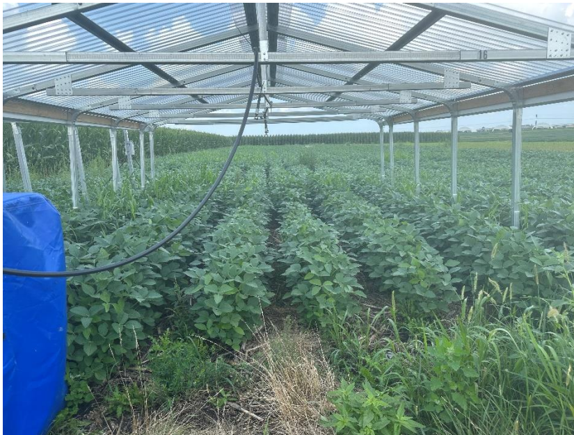
Water application in the field.