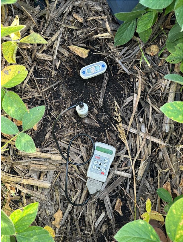
Soil moisture and temperature manual data collection.