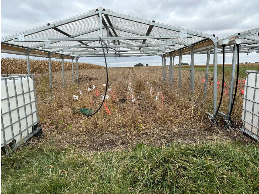
Prepared to Hand harvest soybeans.