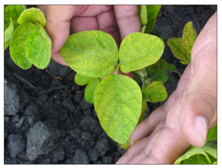
Figure 1. Iron deficiency chlorosis can cause yield loss in certain regions of the United States.