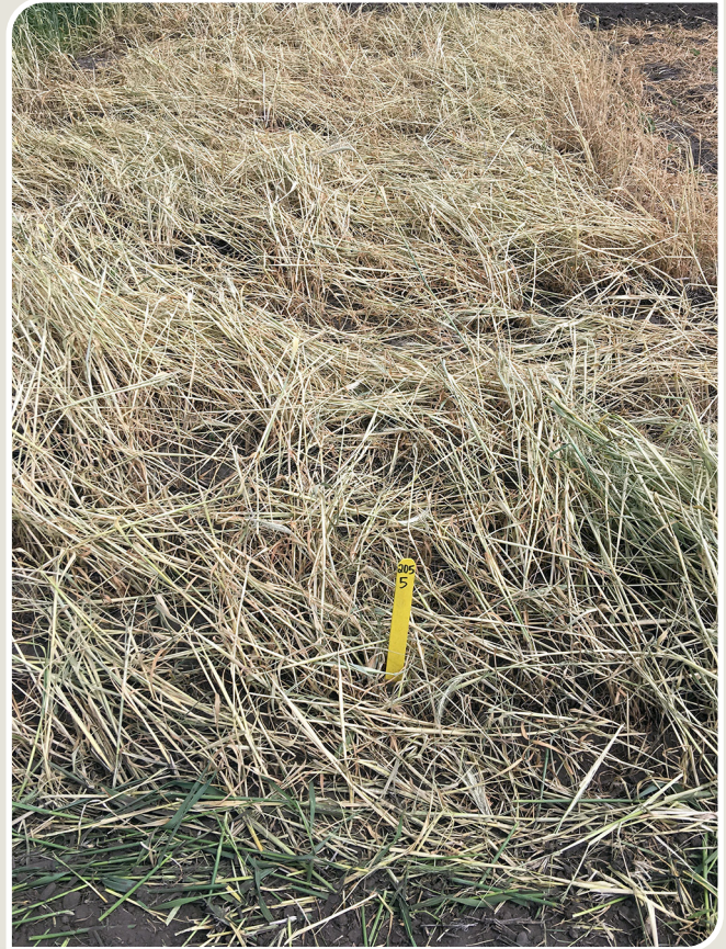
Figure 5. Early termination of rye resulted in minimal weed suppression compared with later termination. In this pair of pictures, rye in the picture on the left was terminated two weeks prior to soybean planting, and rye in the picture on the right was terminated two weeks after soybean planting.

Some evidence indicates that perhaps the N is being fixed by smectitic clays during dry periods, and release may be very slow. The C:N ratio of the mixed-species cover crop including rye, other small grains and broadleaf cover crop species including legumes is not an indicator of N release to the immediately subsequent crop.