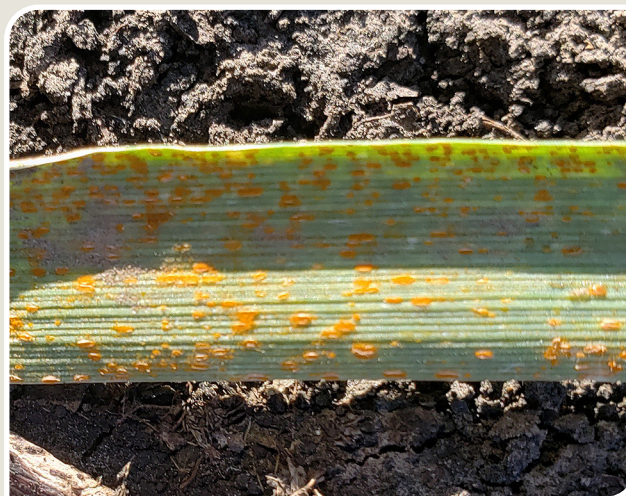
Figure 4. Leaf rust can be found commonly late in the season on most rye varieties grown in North Dakota.