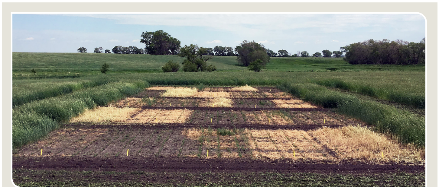
Figure 2. Residual rye biomass as affected by termination timing. Rye in the plots with the least amount of biomass was terminated two weeks before planting. Rye was terminated in other plots at weekly intervals, with the last termination occurring at two weeks after soybean planting. Each row of plots in the photo are replicates of the same treatments.