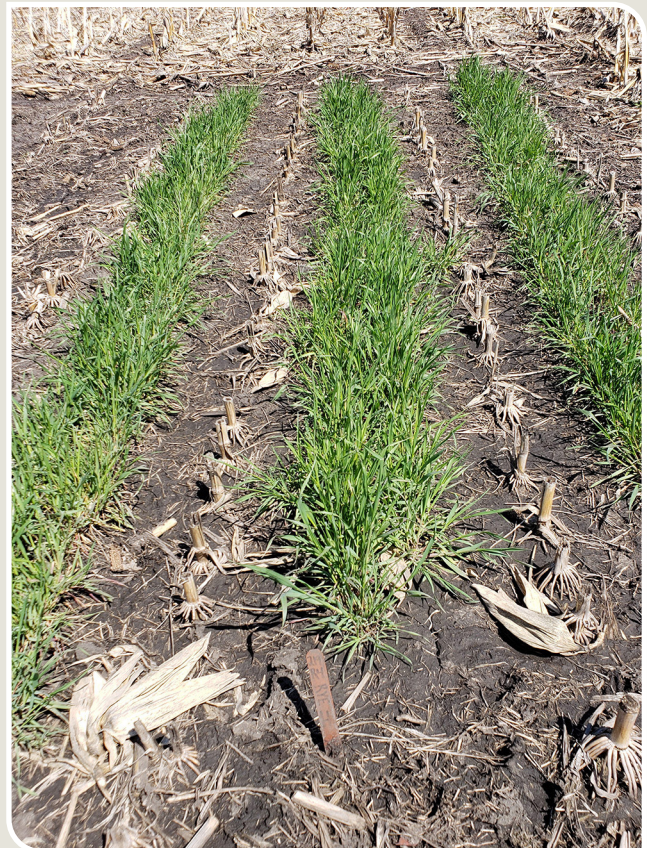
Figure 1. Rye survived the winter poorly (left) when planted in June, when compared with rye in the same field planted later in the year (right).