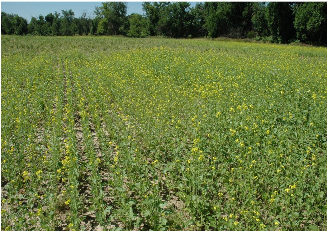
Figure 2. Might Mustard ( Brassica juncea ) planted as a cover crop prior to soybean planting.