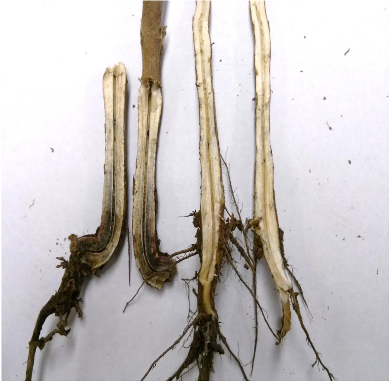
Figure 1. Charcoal rot, caused by the fungus Macrophomina phaseolina causes a grey, charcoal-colored growth in infected soybean roots. The plant on the left is highly infected. The plant on the right has minor infection. As the disease progresses, the roots atrophy and die, limiting seed development and reducing yield.