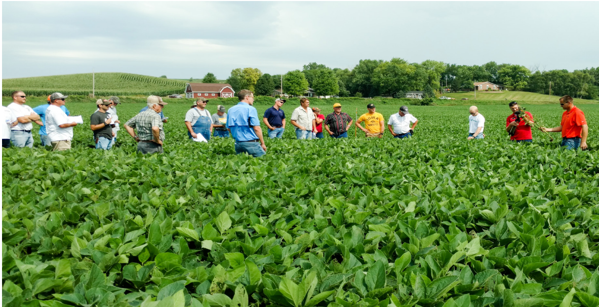
Harrison County 2018 Field Day

Two field days were hosted in 2018: one in June and one in July. A corn weed management field day took place June 18th southwest of Modale. Participants had the opportunity to observe the progress of field trials. They could also learn how to identify Palmer amaranth, as this site was the first case of Palmer amaranth in Iowa. The July field day was held at a no-till soybean field southwest of Logan, again featuring ten weed management programs. These replicated treatments allowed attendees to compare differences in weed management between treatments containing residual preemergence herbicides vs. no residual, and the effects of post-emergence residual applications. A video of the field day can be viewed at protectiowacrops.org .