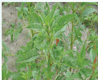
Herbicide resistant waterhemp, Central Iowa

We encourage farmers, crop advisers, agronomists, and other agricultural professionals to participate in the development and implementation of pilot projects addressing a variety of resistance issues: