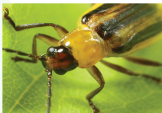
Western corn rootworm resistance to Bt traits, NC and NE Iowa