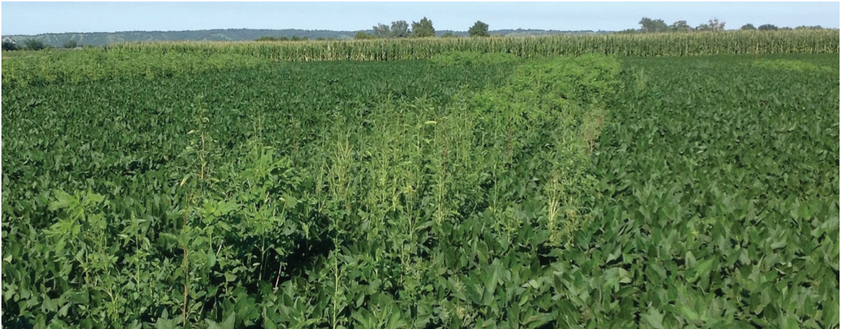
Field infested with giant ragweed and waterhemp

herbicide trial comparison, and fungicide trials are also being observed. A video of the 2018 field day can be viewed at protectiowacrops.org . On August 2, 2018, a group of researchers and representatives from the United States Environmental Protection Agency (EPA) and the United States Department of Agriculture (USDA) heard from the Harrison County Pest Resistance Management Project Team regarding its efforts to share information on local weed resistance in the county. The team hosted the EPA and USDA personnel on a tour of the no-till soybean field. The Harrison County team recognizes that the EPA and USDA are also part of the overall agricultural community that must be engaged to fully deal with pest resistance management.