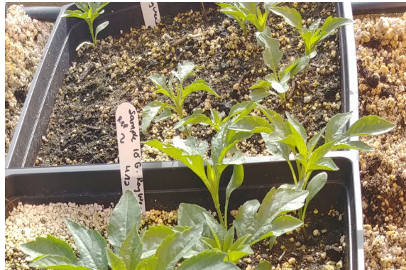
Weed seeds were grown in a greenhouse and treated with common herbicides to identify resistant populations.

Waterhemp, giant ragweed, and Palmer amaranth populations from Harrison County fields were collected and screened for resistance to commonly used herbicides. All 9 populations tested were resistant to Roundup (glyphosate), while 6 of 9 waterhemp populations were resistant to Cobra (lactofen). Of two Palmer amaranth populations tested, two were resistant to Roundup and one was resistant to Callisto (mesotrione). All three giant ragweed populations were resistant to Roundup, with one population resistant to Callisto. These results clearly show that herbicide resistant weeds are common in Harrison County and will continue to spread.