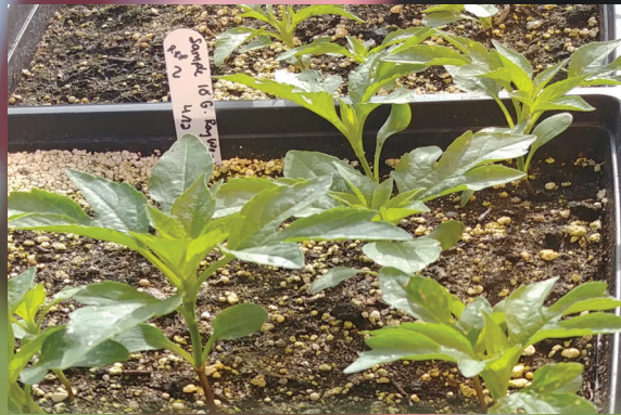
Weed seeds were grown in a greenhouse and treated with common herbicides to identify resistant populations.

Waterhemp, giant ragweed, and Palmer amaranth populations from Harrison County fields were collected and screened for resistance to commonly used herbicides. All 9 populations tested were resistant to Roundup (glyphosate), while 6 of 9 waterhemp populations were resistant to Cobra (lactofen). Of two Palmer amaranth populations tested, two were resistant to Roundup and one was resistant to Callisto (mesotrione). All three giant ragweed populations were resistant to Roundup, with one population resistant to Callisto. These results clearly show that herbicide resistant weeds are common in Harrison County and will continue to spread.