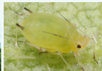
Pyrethroid resistance in soybean aphid, NW Iowa