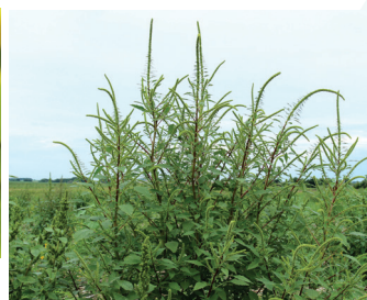
Palmer amaranth, Harrison County