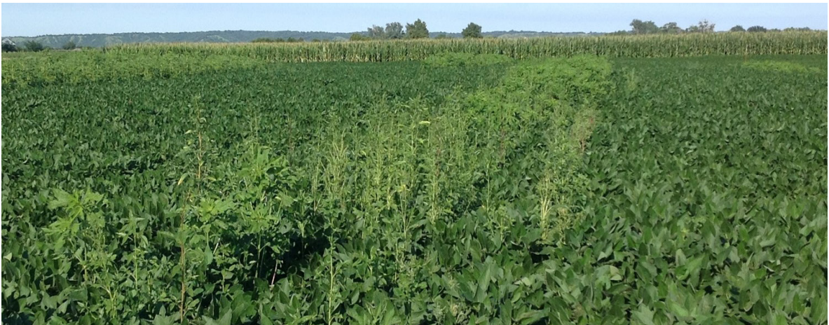
Field infested with giant ragweed and waterhemp

On August 2nd, a group of researchers and representatives from the United States Environmental Protection Agency (EPA) and the United States Department of Agriculture (USDA) heard from the Harrison County Pest Resistance Management Project Team regarding its efforts to share information on local weed resistance in the county. The team hosted the EPA and USDA personnel on a tour of the no-till soybean field. The Harrison County team recognizes that the EPA and USDA are also part of the overall agricultural community that must be engaged to fully deal with pest resistance management.