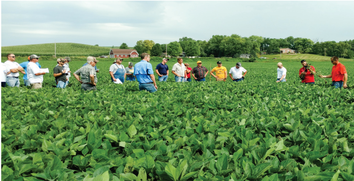
Harrison County 2018 Field Day

Three field days have been held: one in June 2018, one in July 2018 and one in July 2019. A corn weed management field day took place south-west of Modale. Participants had the opportunity to observe the progress of field trials. They could also learn how to identify Palmer amaranth, as this site was the first case of Palmer amaranth in Iowa. The second field day was held at a no-till soybean field southwest of Logan, again featuring ten weed management programs. These replicated treatments allowed attendees to compare differences in weed management between treatments containing residual preemergence herbicides vs. no residual, and the effects of post-emergence residual applications. The 2019 field day included a new