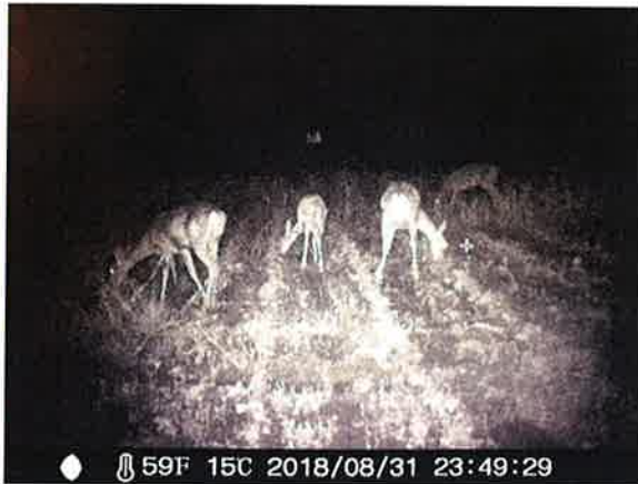
Figure 4. Delaware Valley University students planting the trials and putting up the deer exclusion fence. Game camera image distinguishes between rows in the foreground, but cannot read row number in deer post.