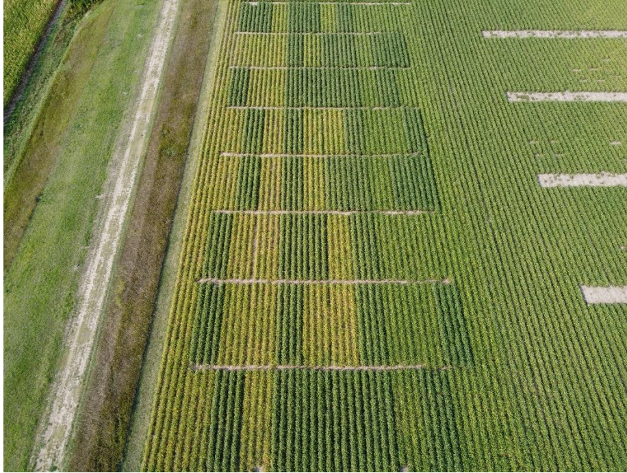
Early planting of Soybean trials at Scandia site. Picture taken on Aug. 30, 2021.