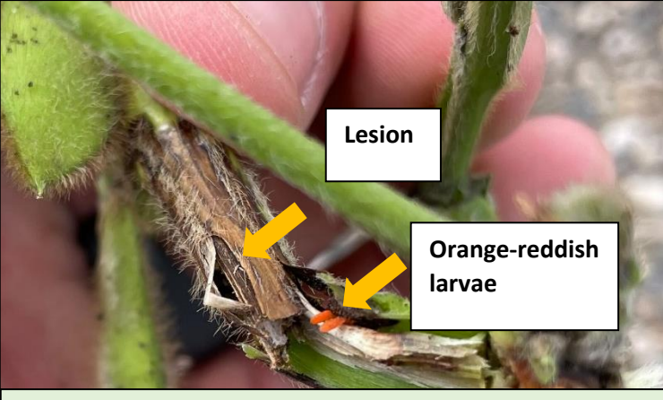
Figure 2. Soybean stem infested with soybean gall midge larvae from Sargent County, ND

Brandon Schulzetenberg, Centrol Crop Consulting, originally reported a suspect soybean gall midge and sent us a photo (Fig. 2) showing two bright orange-reddish larvae on a soybean stem lesion on 16 August 2022. We visited the field to collect larvae for DNA typing the next day. After scouting for a total of 8 hours, we finally found one stem with a lesion on the field edge that had about 10 tiny white to orange-reddish larvae. The infestation was obviously very low due to the difficulty in finding one midge-infested stem. The lesion was located mid-plant,